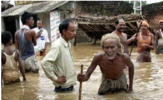
An old man finding his way in the flood waters at Bentkar Bazar of Bayalish Mouza in Cuttack